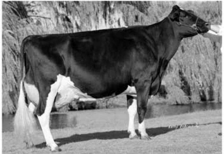
KRULL BROKER ELEGANCE, EX-96 3E GMD DOM 3rd Dam of Cat. #L