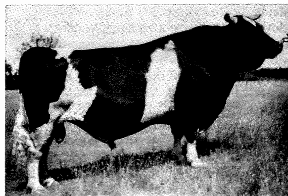
Wisconsin Admiral Burke Lad VG-GM

Joahna Rag Apple Pabst, a Wisconsin native bred bull who changed the Holstein industry in Canada like no single individual animal has ever done. There is a very good chance that almost every Canadian bred animal and U.S. animal descends from him thru his descendants, like: Elevation, Arlinda Chief, Bell, Star Buck, Warden, and many, many more.